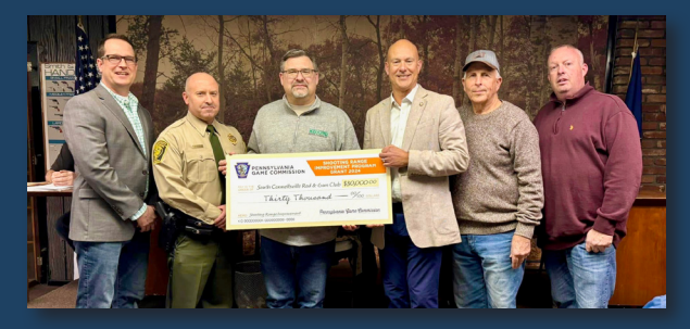
Congratulations to South Connellsville Rod and Gun Club for its $30,000 Shooting Range Improvement grant.