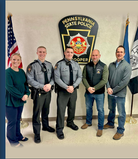
Thanks to our local state police officers for their participation in the annual Shop with a Cop program.