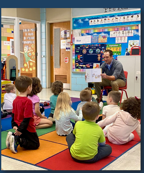
Thanks to The Learning Lamp in Connellsville for the chance to read to the kids.