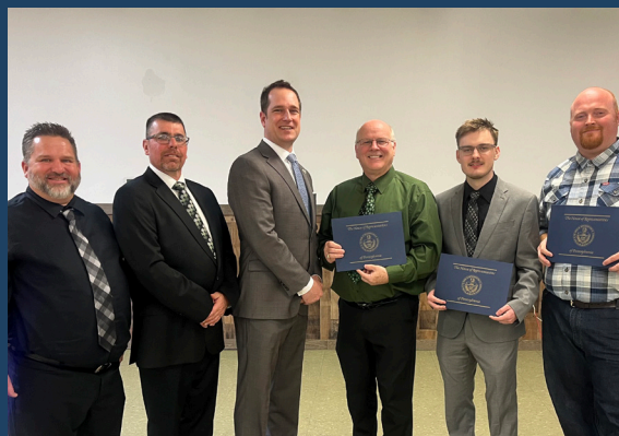
It was an honor to attend New Haven Hose Company's annual banquet in March.