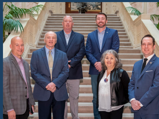
As a strong supporter of our state's agriculture industry, I was happy to see members of the Fayette County Farm Bureau at the state capitol.